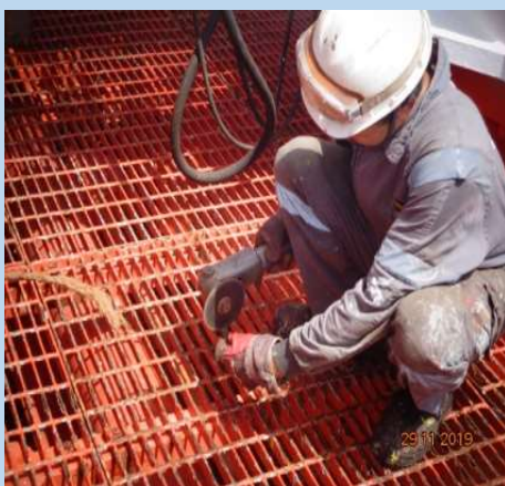
Wrong place & Improper way of using Grinder

Another example is using the grinder; in this case the grinder is being used without guard. The user might get injured in case the disk is broken it is also possible that the other near the area might get injured without using the guard; also the user might get an eye injury. The proper way for this is to wear face shield, gloves and apron for protection