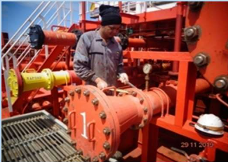
Wrong working without safety goggles, gloves and helmet